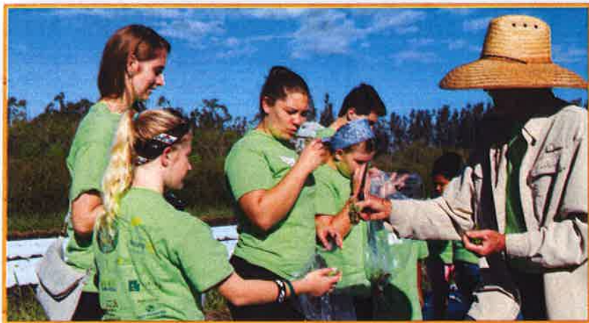
Growing Healthy Kids at Oslo Organic Farm, then off to St. Francis Manor to cook the harvest! Thank you to Interact Club for mentoring the kids.

Website: verobeachsunrise. rotary-clubs.org Twitter: @sunrise_vb Facebook: Rotary Club of VB Sunrise